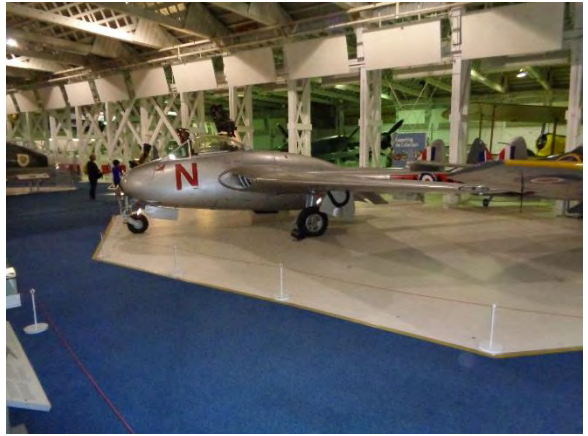
Vampire at the RAF Museum