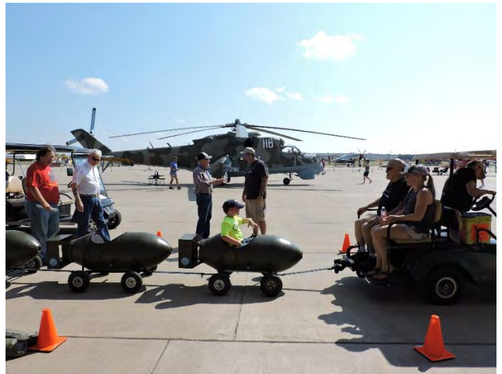
Bomb Train