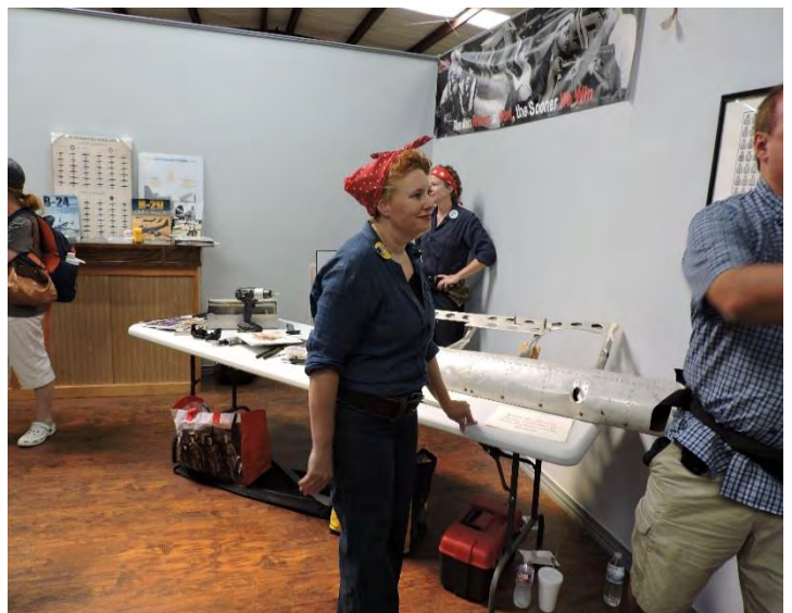
"Rosie the Riveter" exhibit at the Museum