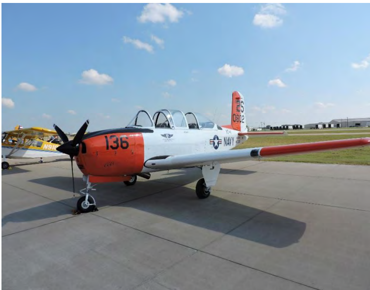
T-34 Navy Plane