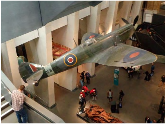
Spitfire at the Imperial War Museum