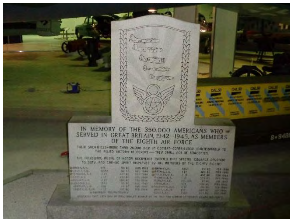
Eighth AF in Great Britain Monument