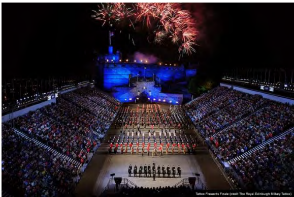
The Royal Edinburgh Military TATTOO 2017