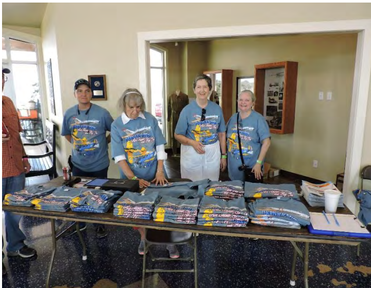
T-Shirt Sales at the Terminal