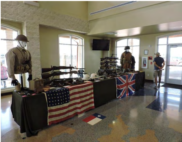
Airport Terminal Exhibit