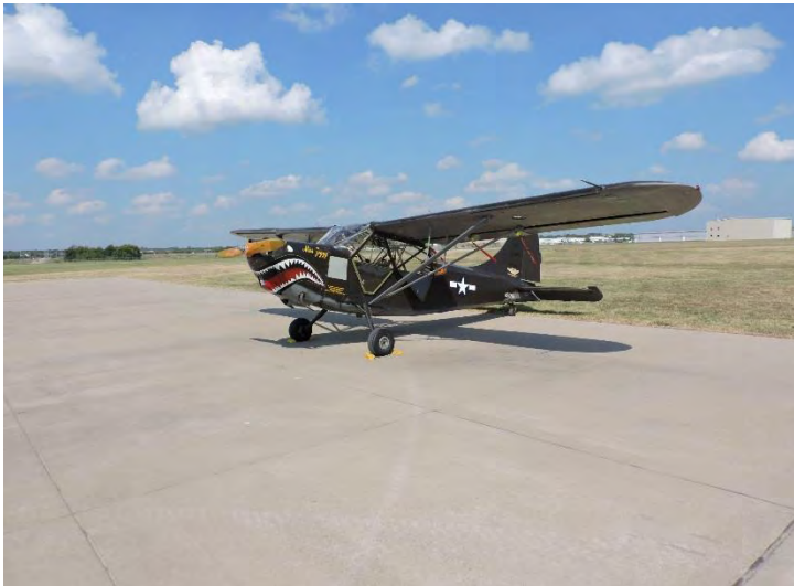
L-5 Observation Plane