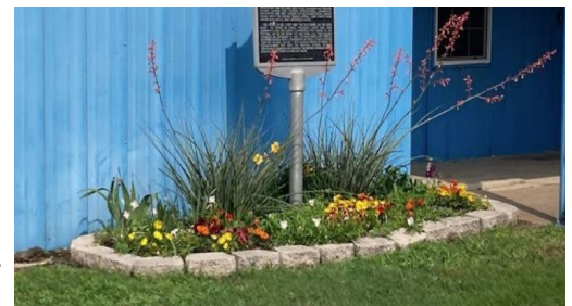
Image of the beautiful garden plot in front of the BFTS Museum. The Terrell Garden Club's in-kind labor and plant donations maintain this landscaped area surrounding the historic marker near the entrance. Thanks to Ann Embry for years of volunteering.

In-Kind Donations by: Gary Weaver, Brent Fonville, Hugh Fraser, & Brookshires Supermarket